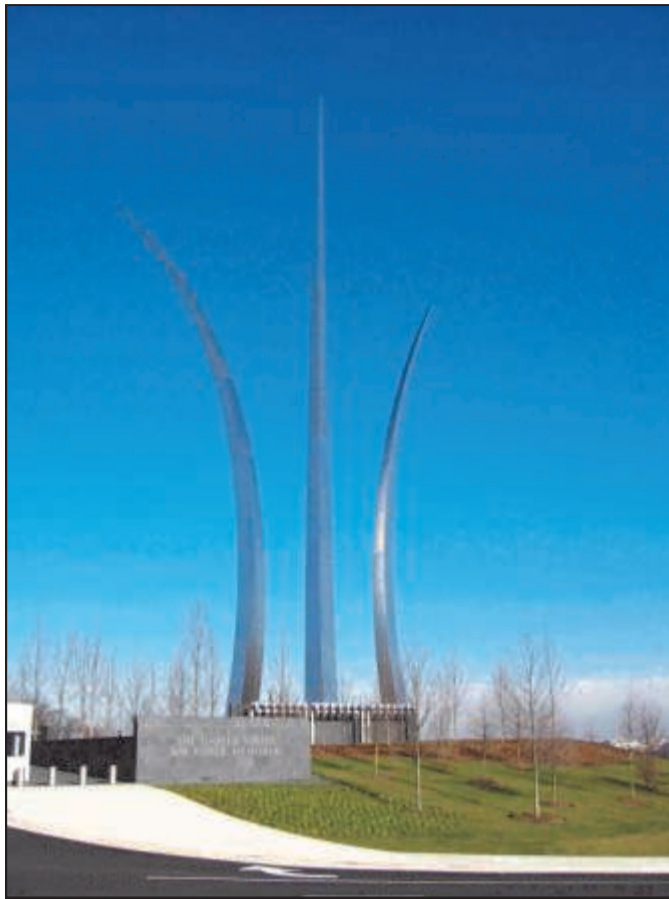
The Air Force Memorial in Washington, D.C. is one of the new destinations for Honor Flight. Consider making an application to go on an Honor Flight yourself or plan a family trip to see the new memorial dedicated to you and your comrades who flew or supported the Flying Fortresses at Thurleigh during World War II.

To learn how to apply to Honor Flight, visit the Honor Flight website at www.honorflight.org or call 937-521-2400.